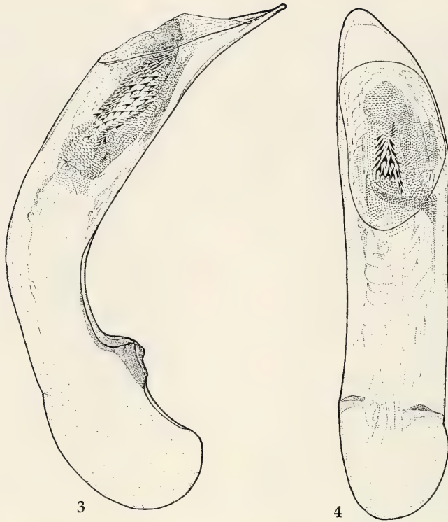
Figs 3, 4. Aedeagus of Notiobia variabilis , spec. nov. 3. Lateral aspect (holotype). 4. Dorsal aspect (paratype).